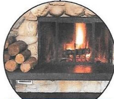
FIREPLACES AND FIREPLACE INSERTS

What heating equipment in my home can cause fires?